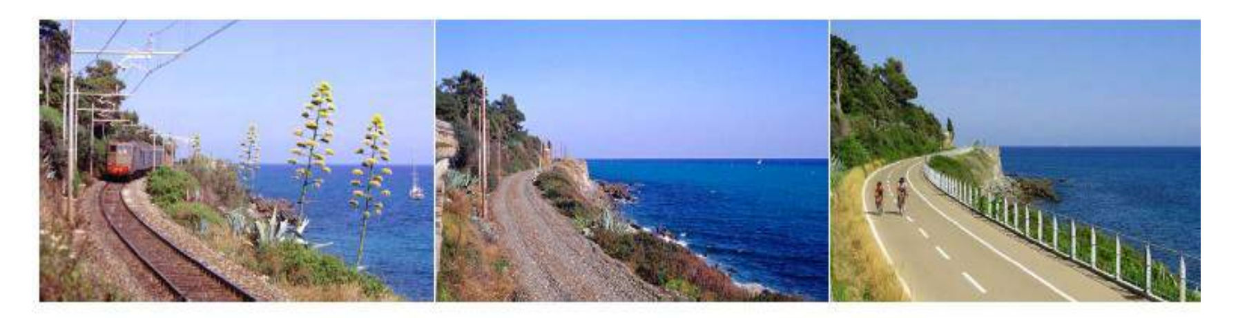
Indagine sulle ferrovie dismesse, recuperate all'uso ciclistico

a cura di Giulia Cortesi e Umberto Rovaldi